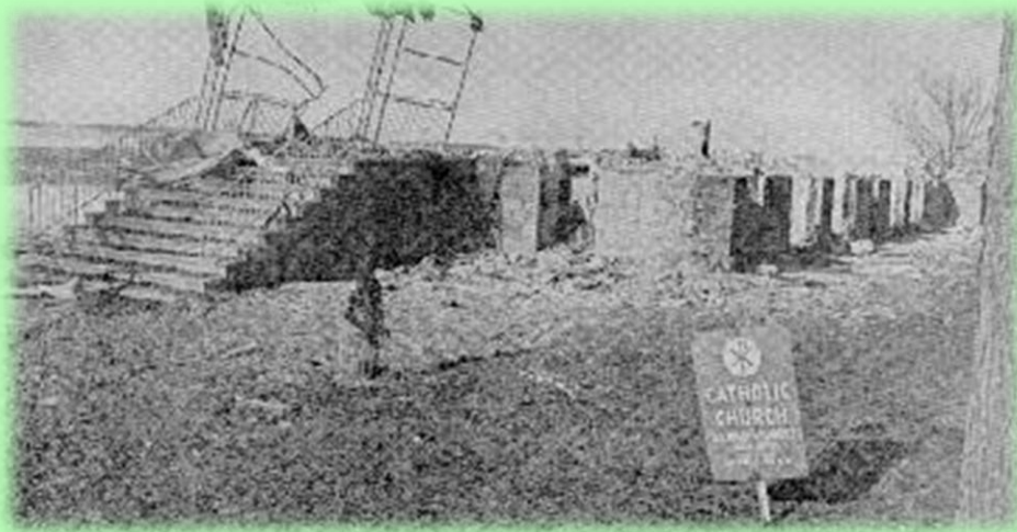
St. Hubert Church; Nov. 30 1966