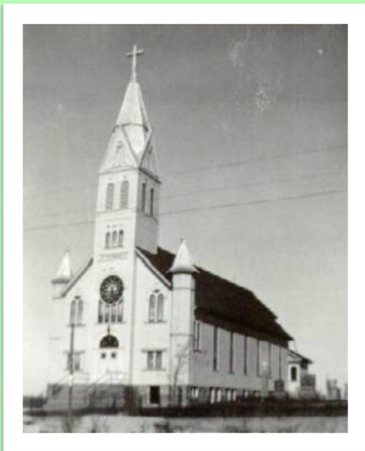
St. Hubert Church