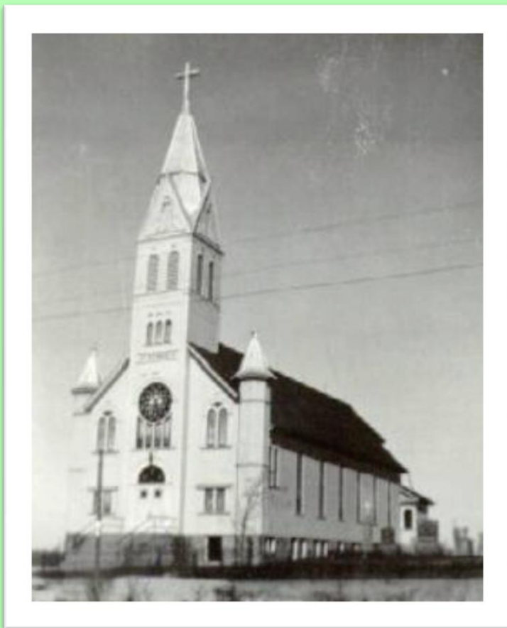
St. Hubert Church