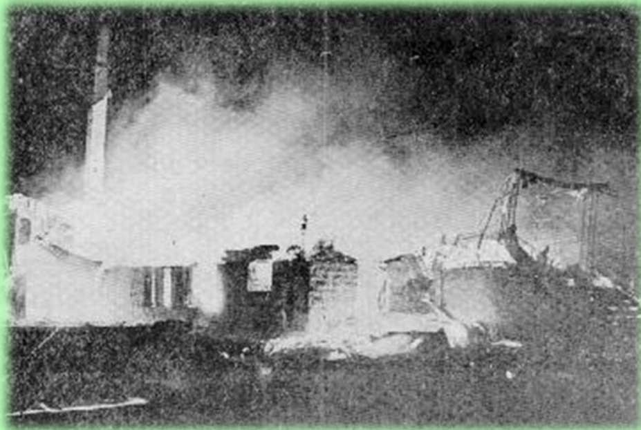
St. Hubert Church Fire; 1966