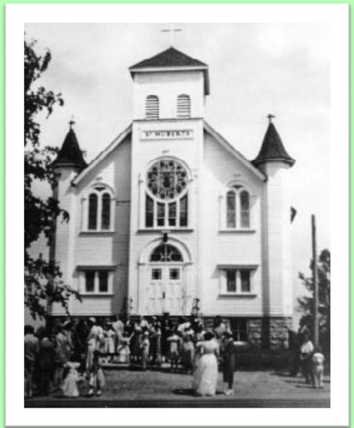
St. Hubert Church 1953