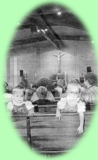
St. Thomas the Apostle 1999