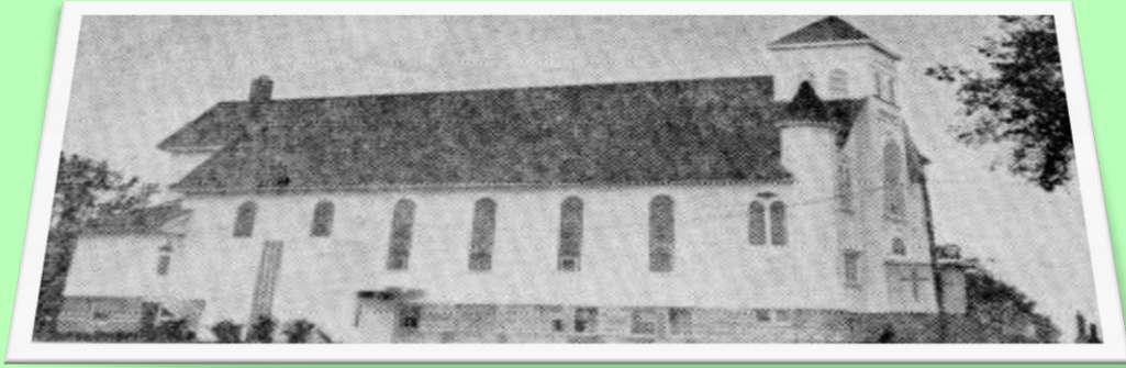
St. Hubert Church