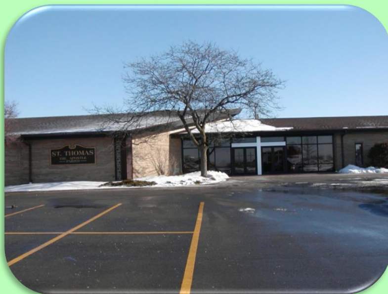
St. Thomas the Apostle 2011