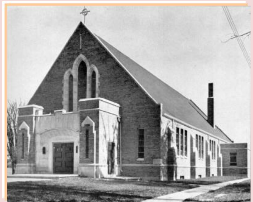
St. Kilian's Catholic Church Built in 1949