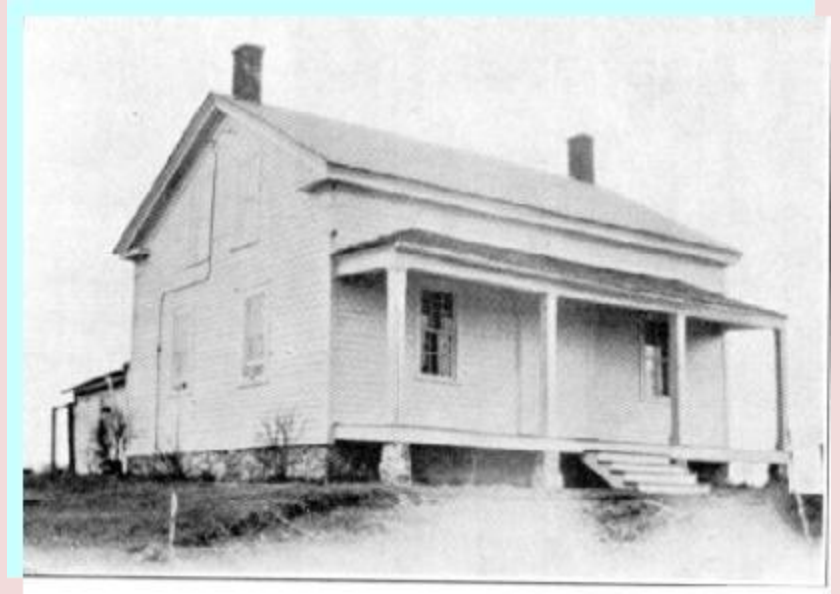
First Rectory Built in 1865