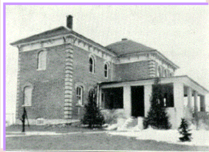
Second Rectory Built in 1885