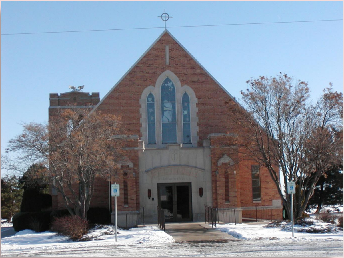
St. Kilian Catholic Church 2011